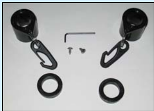
Never Furl package components (Available in white or black molded plastic)

Compare for yourself to other products on the market, including so-called spinner flags and see the difference with this patented, innovative design!